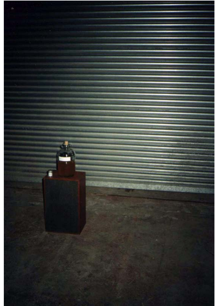
INSTALLATION 51a LIME STREET NEWCASTLE UK TAKING THE PISS : POTLATCH urine, glass 3 gallon demijohn, labeled sample pot (November 2008)