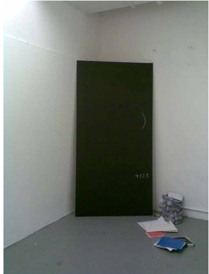
SEMINAR ONE TAKING THE PISS : POTLATCH MDF blackboard, chalk (November 2008)