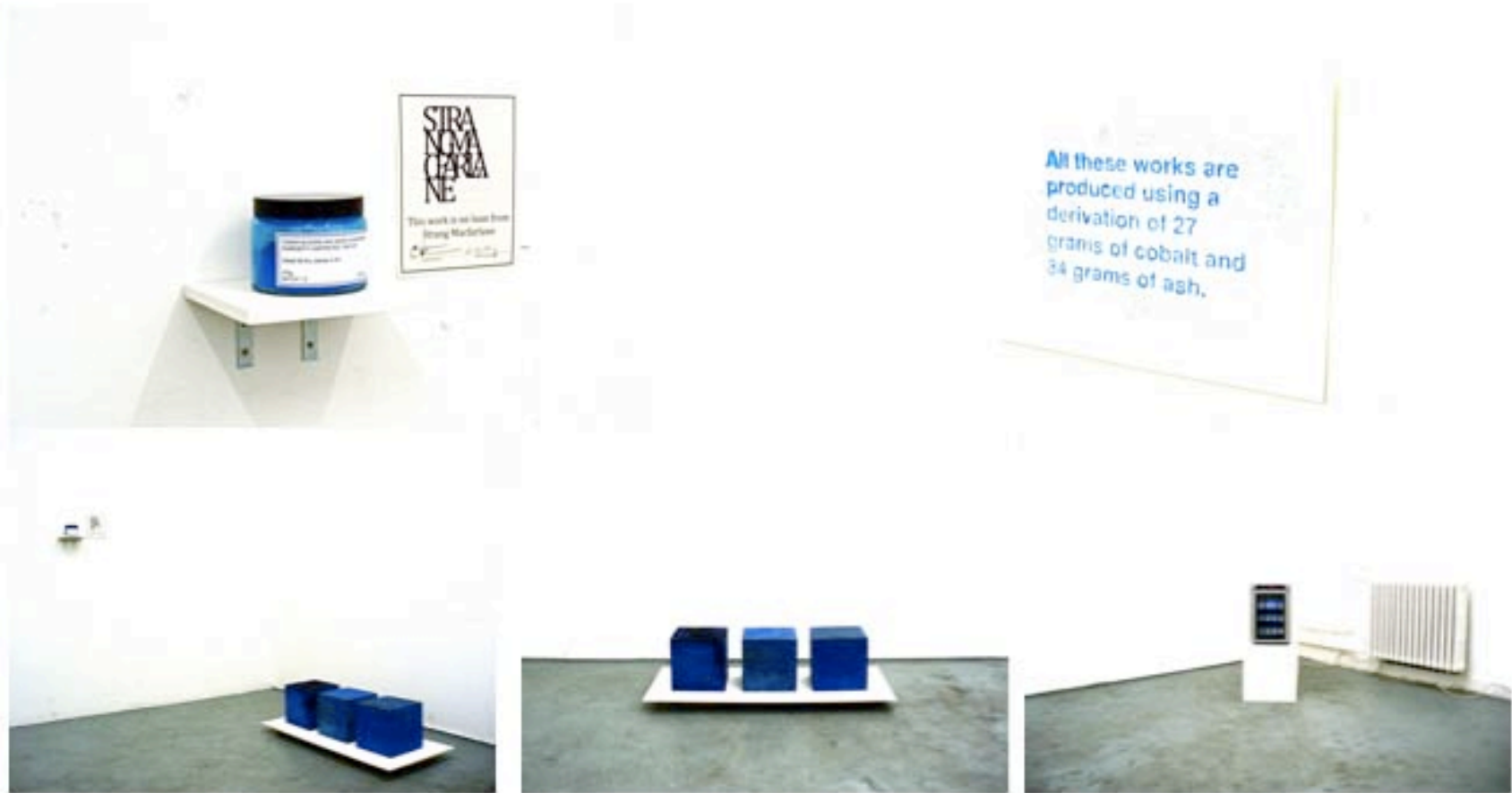
CURIOSITY CASTRATED THE CAT / INSTALLATION; TOWER BLOCKS AND MARILYN MONROE (2009), PERFECT CUBE 27 v.1/2/3 (2009-10), LET'S ALL SACRIFICE MARILYN MONROE (2010)

all these works are made using a derivation of 27 grams of cobalt and 34 grams of ash. (February 2010)